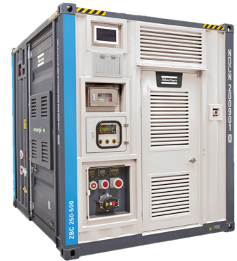
Energy storage Container Image for illustration purposes only